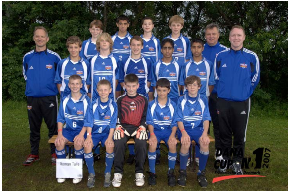
THIS PAST SUMMER, THE TULIS U-13 BOYS BECAME THE FIRST CANADIAN BOYS TEAM EVER TO CAPTURE GOLD AT THE DANA CUP TOURNAMENT IN DENMARK.

During the first week at the Dana Cup in Denmark, the boys dominated play with intelligent and creative football, often maintaining possession for long periods of time. When the ball was lost, the team defended with ferocious tenacity and permitted very few goal scoring opportunities despite the physical aggressiveness of their opponents. They completed the round robin play with a 3-0 record and 8 goals for and none against. The team continued its display of creative foot-