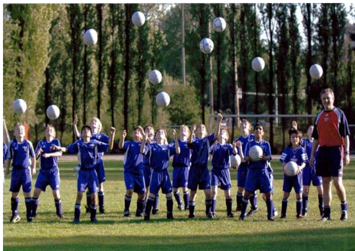
“ABILITY WILL GET YOU THERE, CHARACTER KEEPS YOU THERE.”

For dates and locations of upcoming camps please visit our web site.